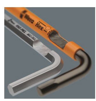
L-keys made from circular material fit into the hand better and allow less strenuous work over a longer period. Additionally, the rubber sleeve provides a pleasant grip, particularly in applications at low temperatures. Colour coding and large stamp enable the desired Lkey to be easily located. Moreover, the round material keys are more robust, particularly where smaller sizes are concerned.